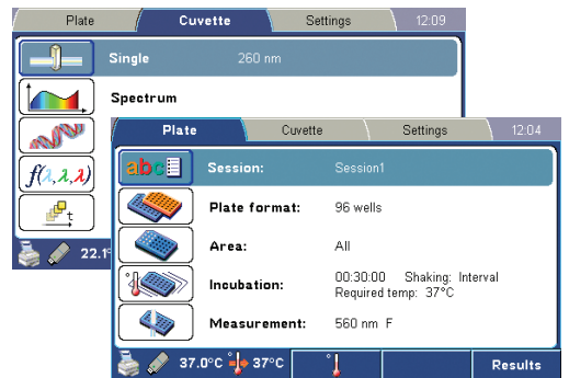
Easy to use internal software for quick plate or cuvette measurements