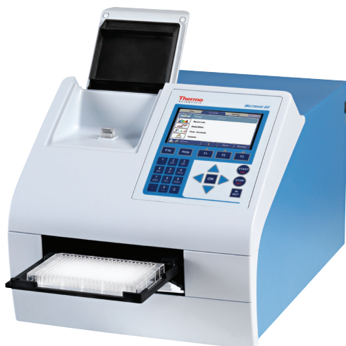
Thermo Scientific Multiskan GO with cuvette

The Multiskan GO can be controlled without a computer using the visual internal software and its large color display making it convenient for quick and simple measurements of both microplates and cuvettes. Ready-made sessions for measuring DNA and RNA concentrations and easy-to-use formulae for