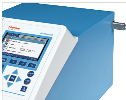
USB port for easy data transfer

The optical system in Multiskan GO has been engineered to ensure first-rate performance and high quality results. The design incorporates a dual beam optical system which includes an internal reference channel ensuring consistent results during any measurement condition.