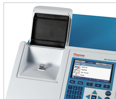
Multiskan GO accepts versatile cuvettes

* In SkanIt Software, the calculation is performed in compliance with the European Pharmacopoeia guidelines.