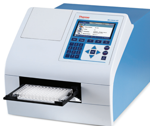
Thermo Scientific Multiskan GO without cuvette